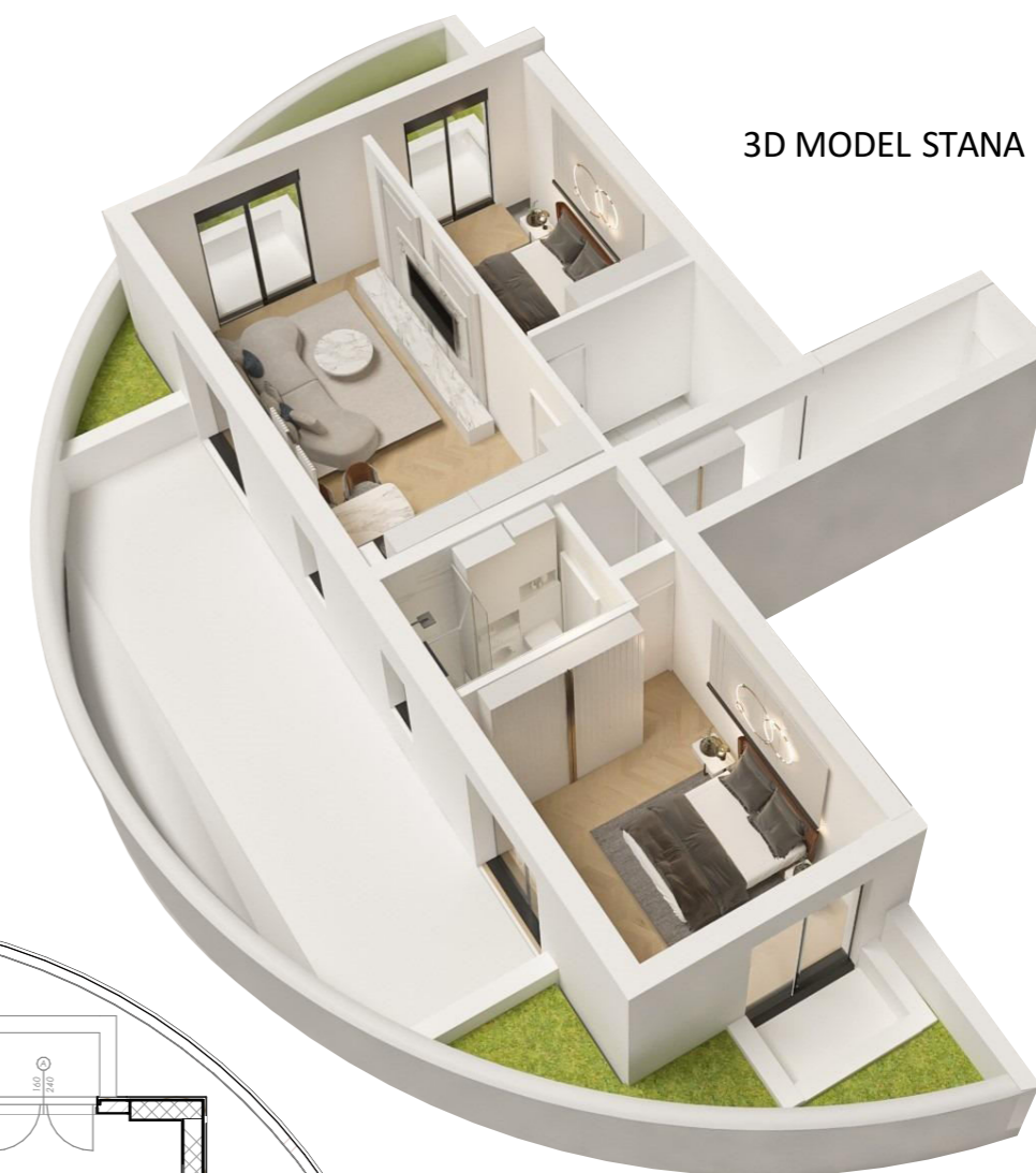
3D MODEL STANA

- OSNOVA TIPSKE ETAZE I-IX SPRATA. - Stanovi: 14, 29, 44, 59, 74, 89, 104, 119, 134.